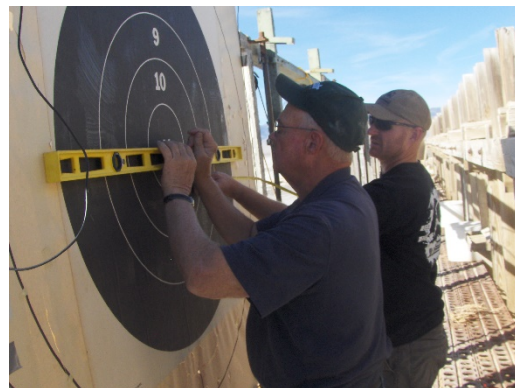
Calibrating the shot hole location on the target.

Just like dropping a stone into water, the sound wave of the bullet will arrive at one microphone ahead of the others depending on the position of the shot. The computer at the target pit calculates the position of the shot based on the time of the sound wave arrival at each microphone and broadcasts the shot location over Wi-Fi back to the firing line. Any cell phone, tablet or laptop computer that has a Web browser can be used to pick up the Wi-Fi signal and display its position on a simulated target at the firing line.