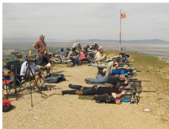
F-Class and Sling shooters at Centerville, UT.

In 1972 I shot my first several high power matches with a slinged Remington 30-06 sporter rifle with stripper clips for rapid fire. This was the rifle I used for deer hunting using my own reloads. High Power matches are shot under NRA rules. You can download the rulebook at http://compete.nra.org/ .