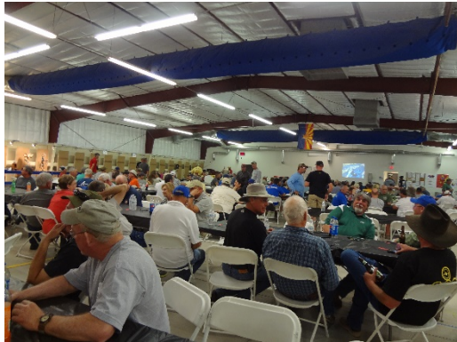
Southwest Nationals award ceremony.

If you enjoy long range shooting, put this match on your list for February of next year!