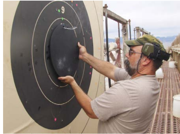
16 inch steel gong compared with 20 inch ten ring at Wendover 1000 yard range.

At our 1,000 yard matches, we may shoot at a steel gong in front of the target pit to find out if we are high or low on our sights. Usually someone will help spot your shots in the dirt. It’s fun to hear the steel gong ring when you hit it at 1,000 yards (see picture).