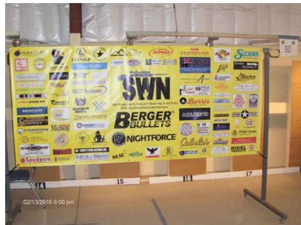
Sponsors for 2016 Southwest Nationals

Sponsors this year donated $150,000 for prizes awards. With an match entrance fee running $125 for five days of shooting, this works out to $375 per shooter in prize money, so the sponsors such as Night Force Rifle Scopes and Berger Bullets are a really making the match interesting for every shooter. This year’s match included four relays, with two shooters in the pit for every target so that target service would be as good as possible.